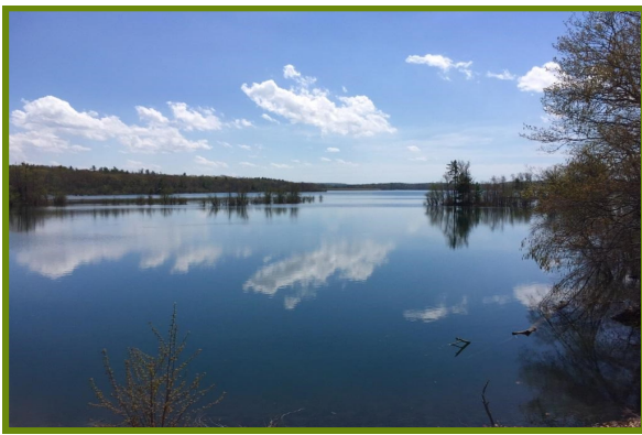
Ashokan Reservoir Rail Trail