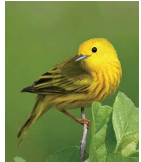
Yellow warbler