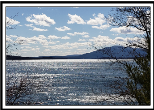
Ashokan Rail Trail, opening Fall/Winter 2019

The County's Climate Action Plan (in draft) seeks to reduce County operation emissions 25% by 2025, ultimately aiming for carbon neutrality. A follow-on Climate Change Adaptation plan will aid municipalities in resiliency and adaptation planning to protect our essential water resources and infrastructure from flood damage. A County-wide culvert assessment, funded in part by a grant from NYS DEC, and using hydrological modeling will be used to right size culverts, enlarge capacity for high water events, and also afford a pass-through for aquatic life. WLC relies on all of their work in our own care for our Woodstock/Saugerties (Eastern Catskills) service area.