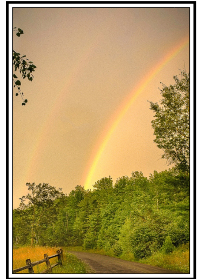
MacDaniel Road Rainbow.